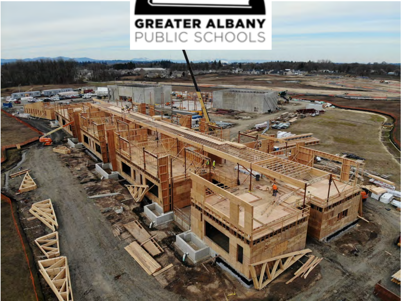
Meadow Ridge Elementary School March 05, 2019